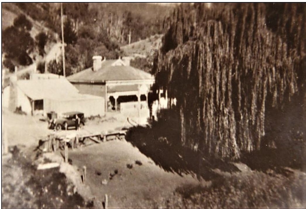
Original Hunter house (left) and a second house brought from Port Adelaide area (photo c.1950)