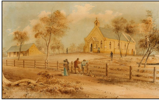
St James' Anglican Church, Blakiston Watercolour by S T Gill 1848