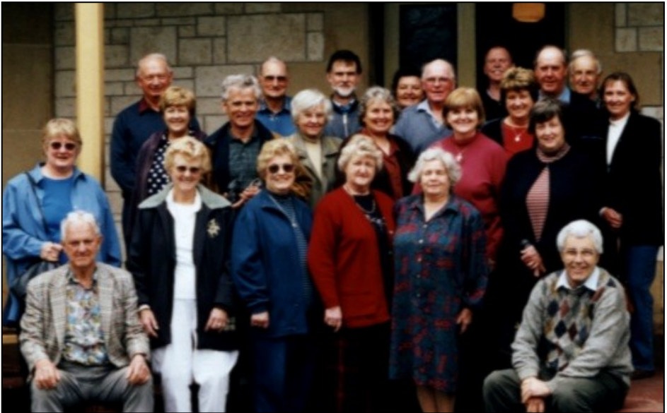
Our field trip touring group photograph from 2002